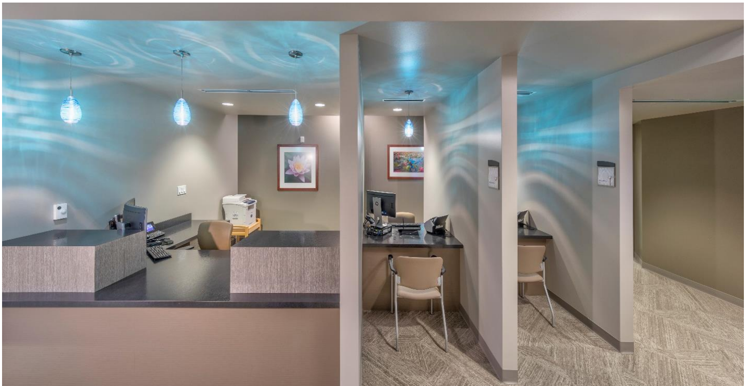
Alaska Regional Hospital, Alaska Imaging Alliance: Anchorage, Alaska