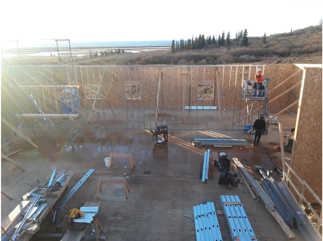
Unalakleet Elders' Assisted Living Facility: Unalakleet, Alaska

Overall, F&W's goal is to complete our projects safely, while maintaining quality, schedule and cost. We believe our skill and expertise allows us to meet the challenges of any project and look forward to further developing Alaska.